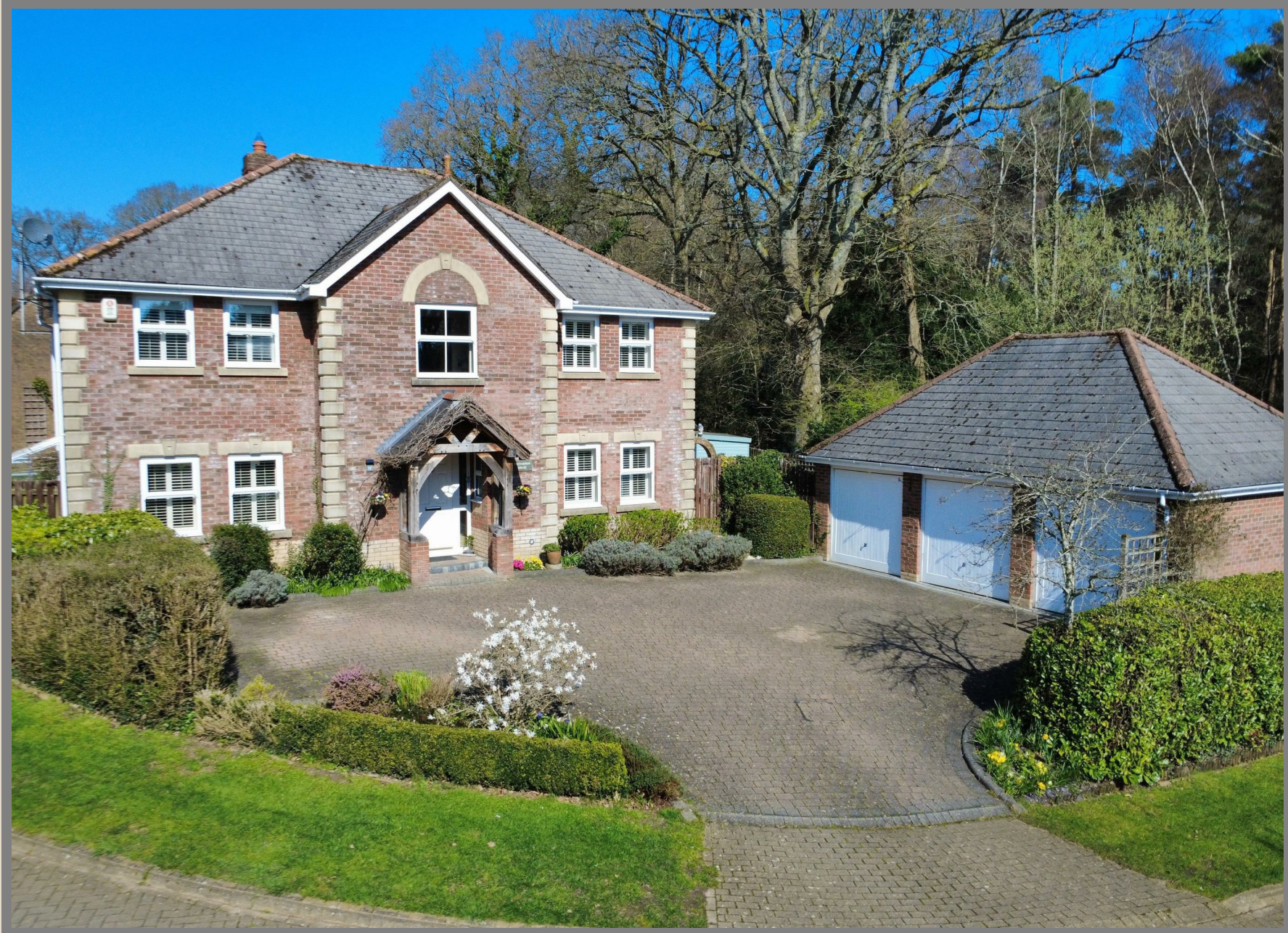
TREYARNON, Woolton Lodge Gardens, Woolton Hill, RG20 9SU